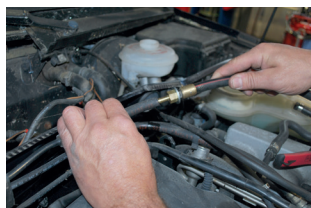
Extraction via the FUEL INLET HOSE ...