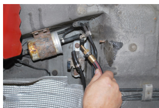
... or at the gasoline filter