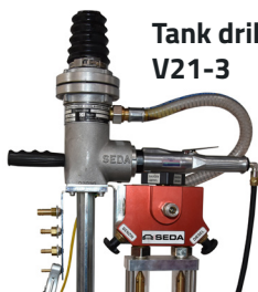
Tank drilling machine - V21-3