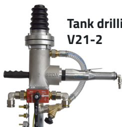
Tank drilling machine - V21-2