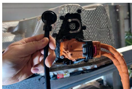
High-voltage battery connector, using the VW e-Golf as an example