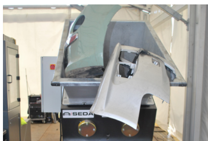
Practical size for the feed opening

The shredder can be manually loaded and optionally equipped with automated loading systems, such as a conveyor belt, screw conveyor, or elevator. The shredded material is discharged via a conveyor belt, and an optional system is available for separating liquids from solids.