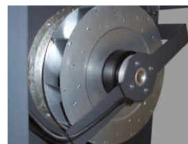
◀ Radial fan