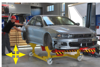
Easy to maneuver by one person