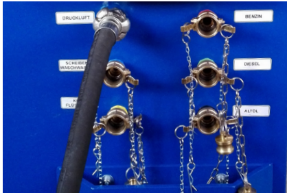
Pre-installed quick couplings for tank lines