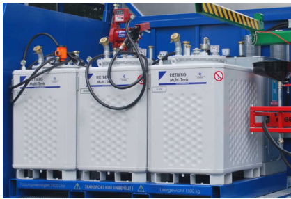
Optional tank platform