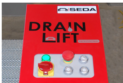
Easy-to-operate control panel