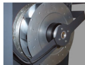
◀ Radial fan