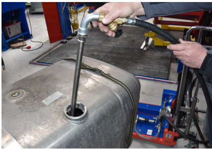
Extraction via the suction lance