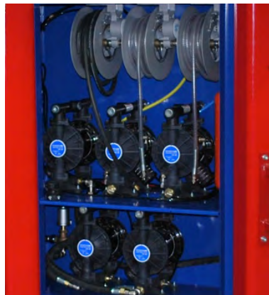
Integrated pump system