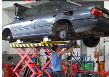
Used with different types of vehicle ramps