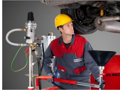
Fixed on swing arm

The reliable air powered drill and specially designed drill bit make light work of metal or plastic fuel tanks while the powerful vacuum unit sucks the drilling head flush against the fuel tank, creating a seal, eliminating petrol fumes and allowing a drainage rate of up to 20 liters per minute. The drilling process itself only takes a few seconds.