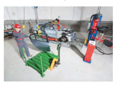
... and dismantling at the same place!