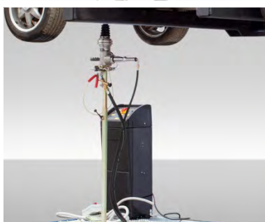
Mobil version cut quite a dash