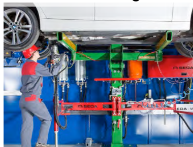
Used with different types of vehicle ramps