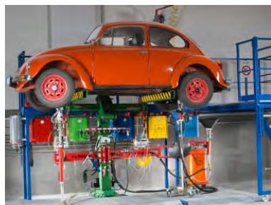
Fixed on a swing arm