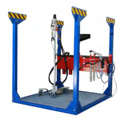
Also available without the two extra-sumps

The individual components of the system are each configured so that they form a closed system reducing leakage and vapour output. A safe working system operated by compressed air.