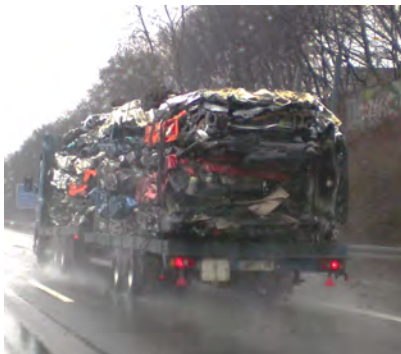
Compacted car bodies are easy to transport

The extremely powerful engine ensures even the largest vehicles can be flattened effectively.