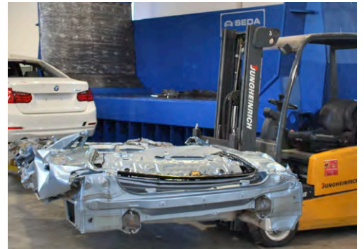
Pressed flat car bodies ready to transport

In addition submersible pumps for liquids and a central lubrication system for the lids and cylinder bearings is also available per request.